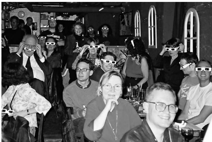
The audience at a Cornelia Street Café cabaret. Can you recognize the Academy member in the crowd?